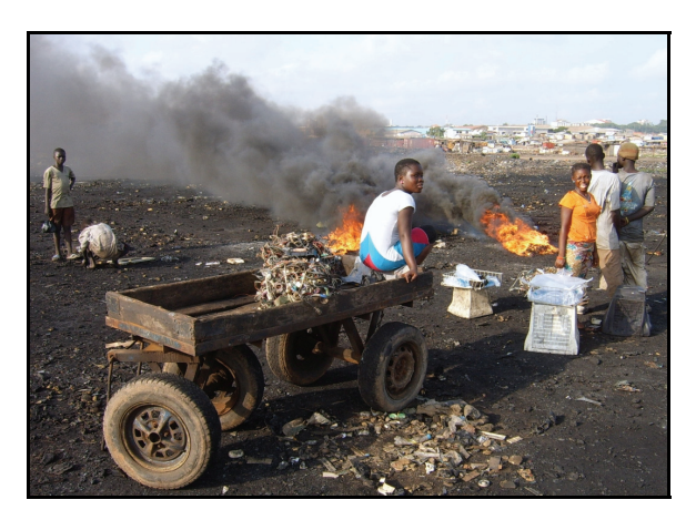
Figure 2: Burning of cables at Agbogbloshie Metal Scrap Yard, Accra

While exposure to lead fumes or dust is known to cause multiple disorders, including neurological, cardiovascular and gastrointestinal diseases [17], exposure to cadmium fumes or dust leads to malfunctioning of kidneys [27] and respiratory system [28], and possibly lung cancer [29]. On the other hand, even in Europe, workers in electronics recycling facilities have been found to have higher blood levels of PBDEs than other workers [9], [30]. Consequently,